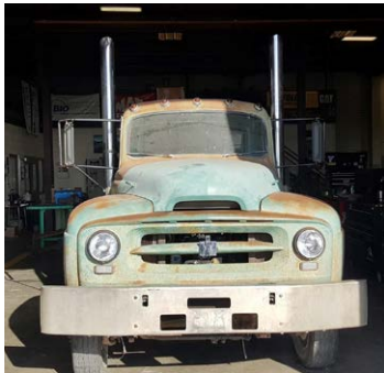
New exhaust stacks installed

We took the power train out from under the IH and replaced it with the 450. We have been piecing and modifying it piece by piece. We are putting a Stahl service body on it.