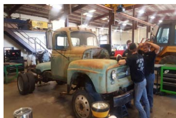
Service body installation

The shop truck's new engine! What do you all think? Ceramic marine pistons, bigger Hamilton cam, 100 hp injectors, girdle and studded with fire ring, beehive valve springs.